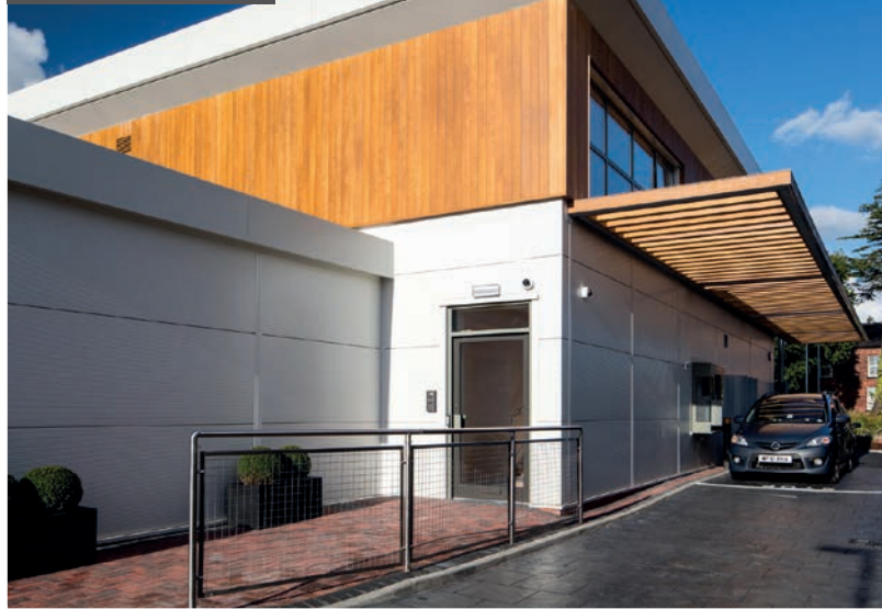
Prestwich, United Kingdom