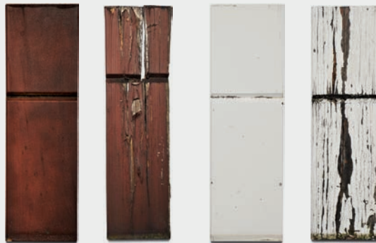
Acetylated wood Unmodified wood Acetylated wood Unmodified wood Translucent WB Acrylic Coating Opaque WB Acrylic Coating