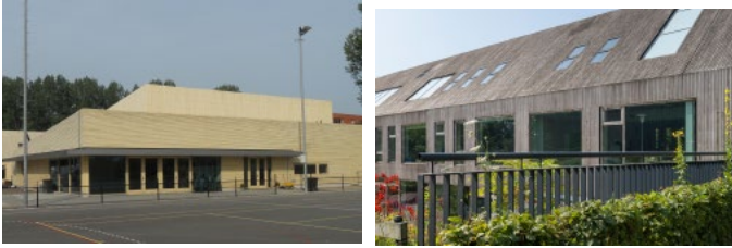
KRAAIJVANGER ARCHITECTS © RONALD TILLEMA ILLUSTRATION OF WEATHERING OVER TIME

Testing of a small area before full use is recommended. Note that some products may bleach the wood if over applied. For more details on cleaning Accoya cladding, please refer to our Wood Information Guide.