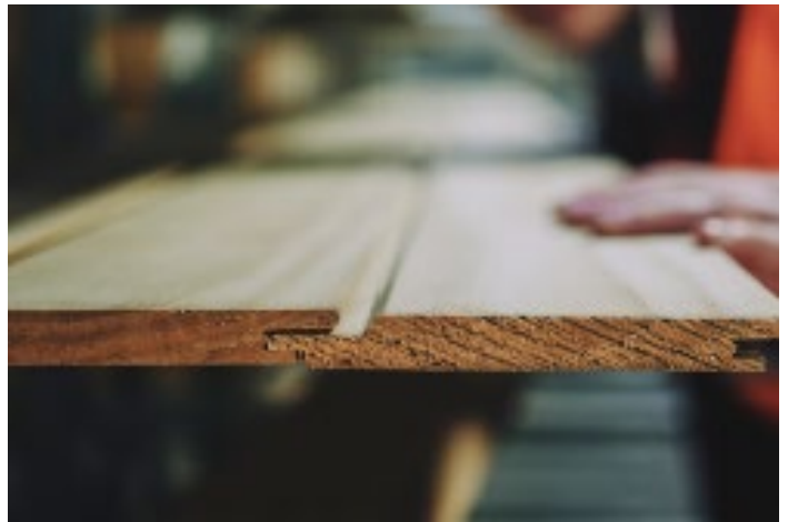
EXAMPLES OF GOOD DESIGN PROFILE