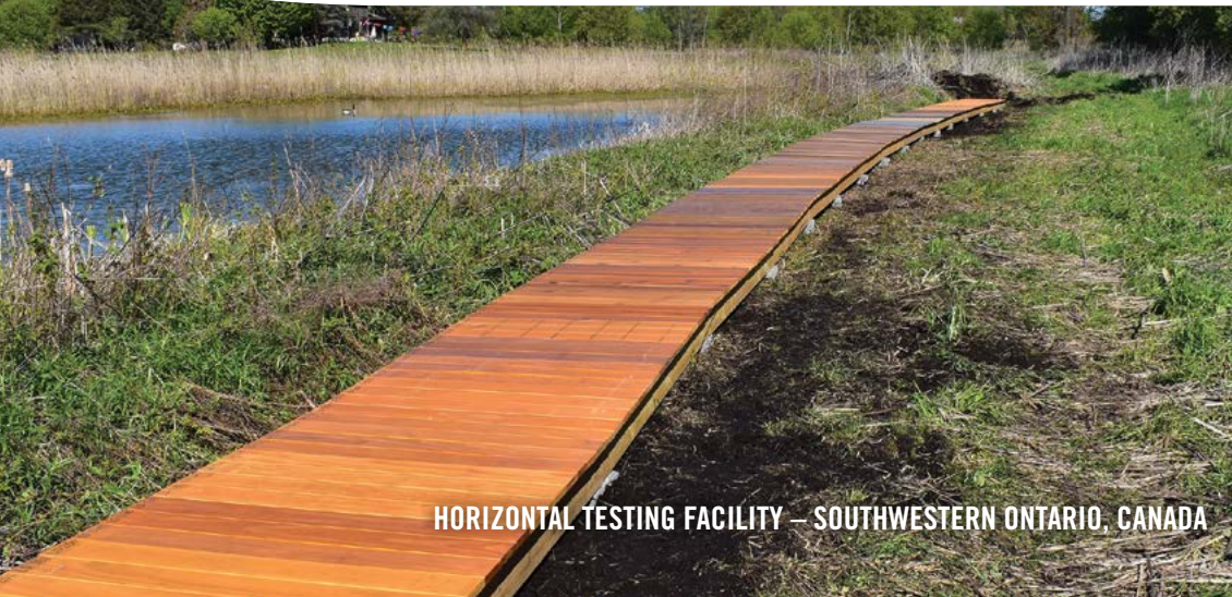
HORIZONTAL TESTING FACILITY – SOUTHWESTERN ONTARIO, CANADA