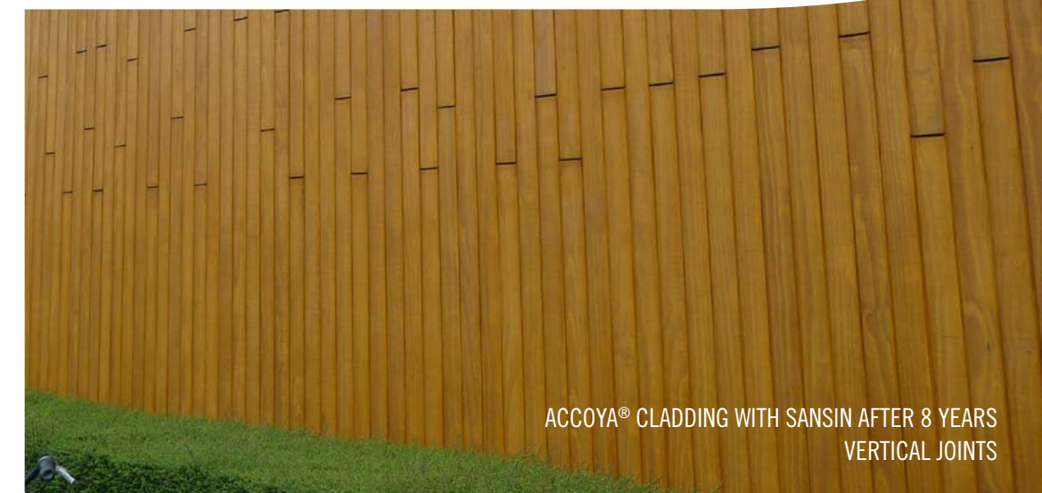
ACCOYA® CLADDING WITH SANSIN AFTER 8 YEARS VERTICAL JOINTS