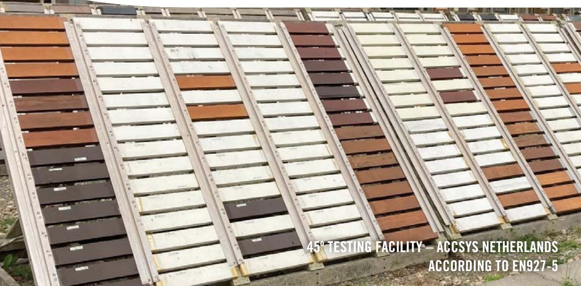
45° TESTING FACILITY – ACCSYS NETHERLANDS ACCORDING TO EN927-5