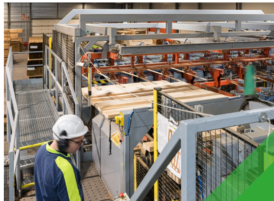
Out feed area of Stacker 2

Accsys reported record Accoya production in the third quarter, and again in the fourth quarter of FY23 providing record sales of 39,387m 3 in the second half of the year, ending March 31st. Accsys also sold 63,344m 3 of Accoya in FY23 as customers sought solutions for high performance, sustainable and durable building materials. This demonstrates the successful increase in capacity at the Arnhem production facility. We're thrilled to be providing this much deeper availability to the market, and we appreciate all of our customers' support at a time when the general world timber markets are not their most buoyant.