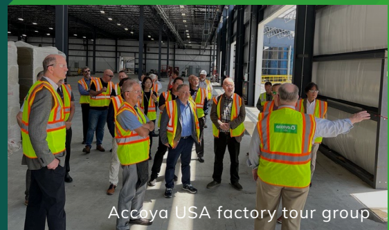
Accoya USA factory tour group

Thanks to all those who attended the event.