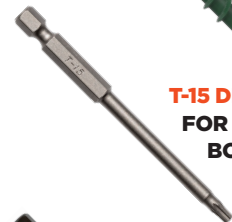
T-15 DRIVER BIT FOR SQUARE BOARDS